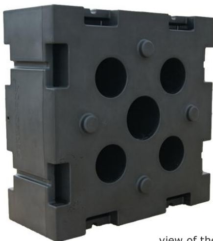
view of the bottom