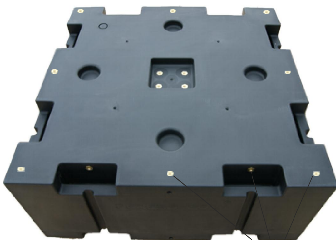
integrated screw thread (M10)